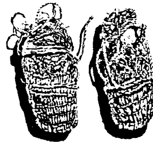
Sagebrush sandals found in the Fort Rock Caves have been dated at about 9,000 years. The area is rich in Indian artifacts.