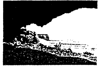
Caves in the Fort Rock State Park area, southeast of Sunriver, are among the oldest known habitats of man in North America.