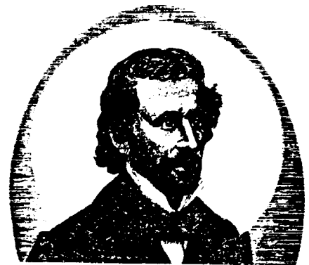
John C. Fremont was one of the early white men to explore central Oregon. Records indicate he passed through the exact site of Sunriver in 1843.