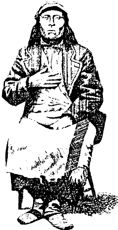
Indian Chief Paulina bitterly resisted the white settlement of central Oregon, terrorized pioneer ranchers throughout the high lava plains. The Paulina mountains are named for him.