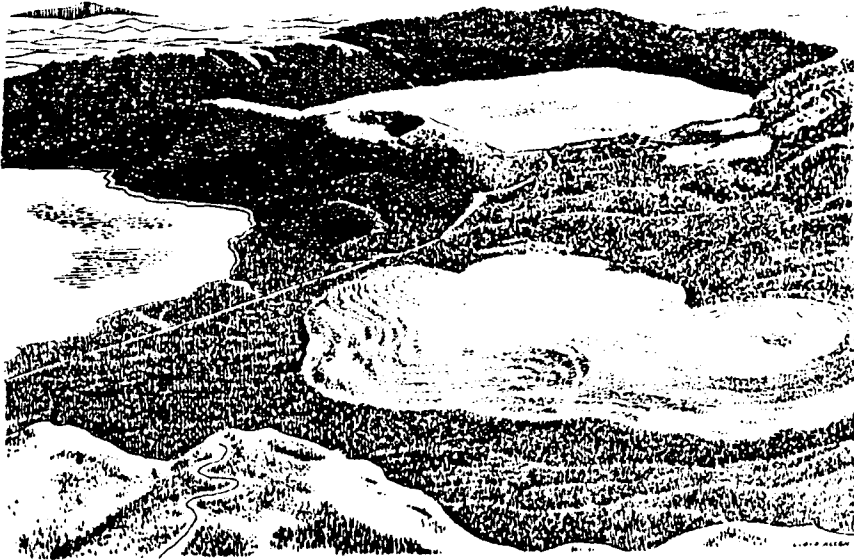
Newberry Crater, a volcanic caldera of prehistoric origin, is a scant half hour's drive east of Sunriver. It contains two scenic lakes, East and Paulina, famed for fishing.