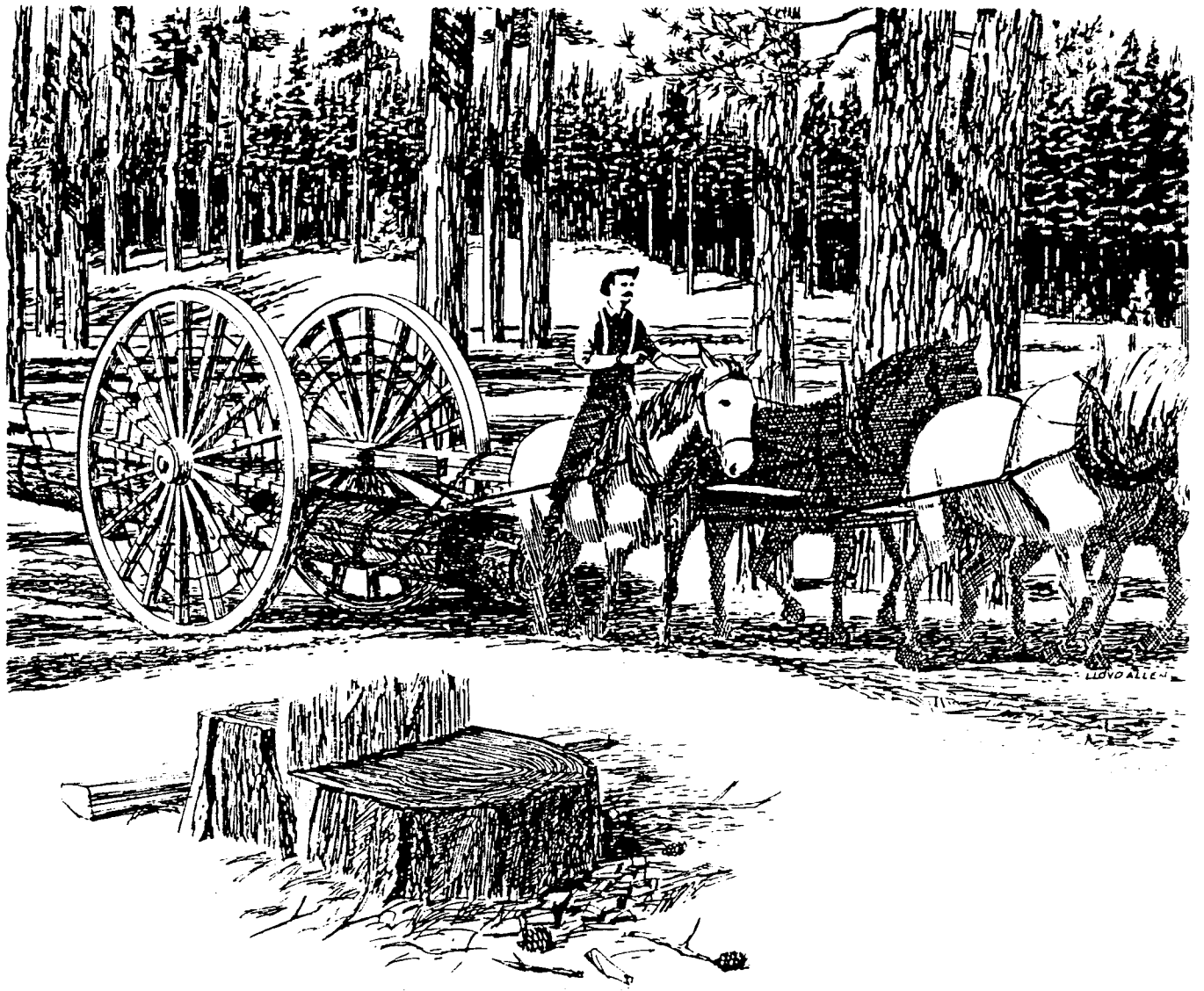
Early-day logging in the central Oregon pine country was distinctive for the "big wheels" used to bring logs out of the forest. Besides horses, oxen and later steam tractors provided motive power.